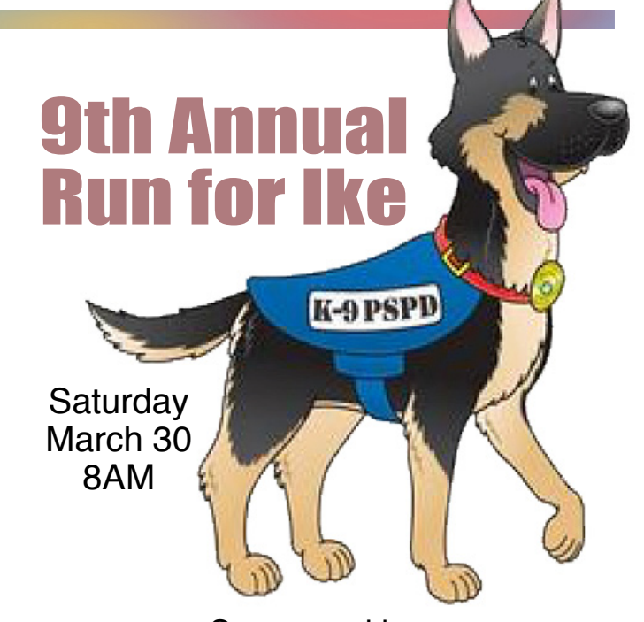
Sponsored by Palm Springs Marathon Runners Register at:

The Shamrock 5K is a 3.1 mile lively run/walk sponsored by the Palm Springs Lions Club and celebrating the fun and frolic of St. Patrick's Day. Awards all finishers will receive a terrific St. Patrick's Day finisher medal. Age group awards presented 3 deep in 5 year age groups through 85+. Course run or walk this beautiful course right in the heart of Downtown Palm Springs. View beautiful scenery as you walk past gorgeous homes and the majestic desert landscape. In addition to a tech t-shirt, finisher medal, Pancake Breakfast and Green Shades, all 5k participants over 21 years old also receive a St. Patty's Beer (proof of age required). T-shirts a festive event t-shirt is included with your entry fee. Packet pick-up will be held at Running Wild 611 S. Palm Canyon, Palm Springs on Friday, March 16th from 11AM - 5PM. Post race party. A special St. Patty's Day Breakfast will be served to all race participants post-race featuring those famous Palm Springs Lions Club pancakes with a special St. Patty's Day twist. Public parking is conveniently located near-by on Palm Canyon and surrounding parking lots and neighborhoods.